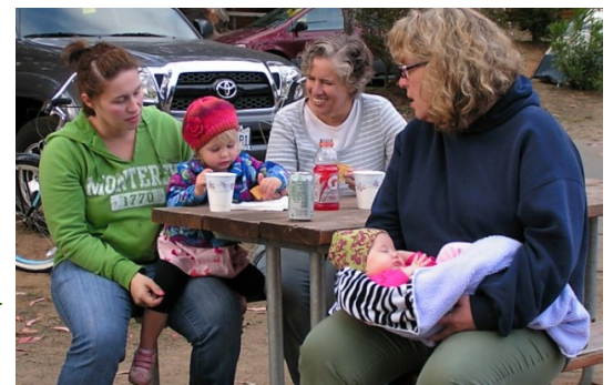
Photos from Felton Presbyterian's annual church camp out, September 2011.