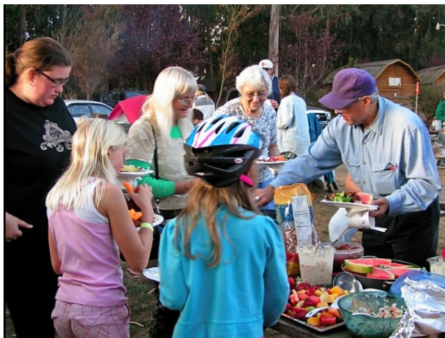
Felton Presbyterian Church camp out September, 2011.

Felton Presbyterian Church feels strongly about this and would like to help you create or update your will, on behalf of your local church. To learn more about this ministry, please visit www.feltonpresbyterianlegacy.org/pg . We do hope that you will find this service a help and a blessing to you and your family.